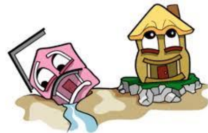
Building "Spiritual Houses"

All Scripture is given by inspiration of God, and is profitable for doctrine, for reproof, for correction, for instruction in righteousness, that the man of God may be complete, thoroughly equipped for every good work. 2 Timothy 3:16